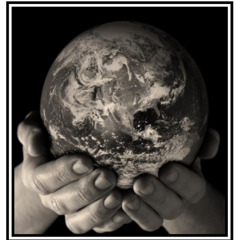
GO FORTH Like Christ