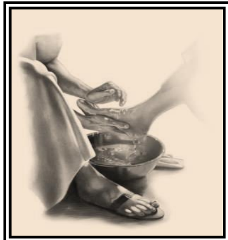
SERVE Like Christ